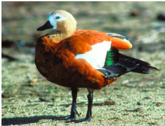
In the ABA Area, exotic Ruddy Shelducks are often encountered in and around zoos, parks, and private collections. But is it possible that wild birds from Eurasia have vagrated to the ABA Area? The ABA Checklist Committee is uncertain. Los Angeles, California; February 1994.