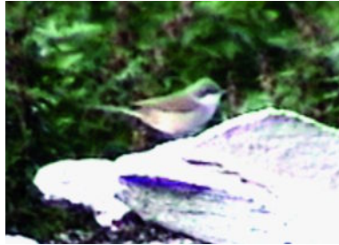
It was straightforward to assign this Sylvia warbler to species—it is a Lesser Whitethroat ( Sylvia curruca )—but it is not clear to which subspecies it belongs. Gambell, St. Lawrence Island, Alaska; 8 September 2002.

Record # 2003-3; 1 bird. 25–30 August 2002, Gambell, St. Lawrence Island, Alaska; found by Paul Lehman. Excellent video accompanied the documentation. A color photograph graces the cover of North American Birds (2003; 57[1]), and additional color photographs and details are provided in Lehman (2003). The record was unanimously accepted by the ABA Committee and by the Alaska Checklist Committee.