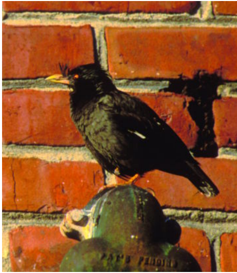
The introduced Crested Myna once numbered into the thousands in and around Vancouver, British Columbia. The population declined sharply in recent decades, however, and the last survivors were hit by cars and killed in February 2002. The species has been removed from the ABA Checklist. Vancouver, British Columbia; July 2001.

In addition to having a relatively small permanent population in northwestern Africa and the Ethiopian highlands, the species breeds from southeastern Europe to Lake Baikal and Mongolia. It winters from the southern part of the breeding range