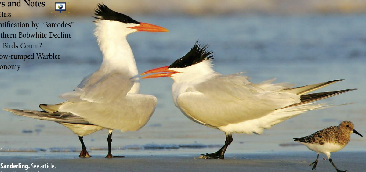
Royal Terns and Sanderling. See article, p. 56.