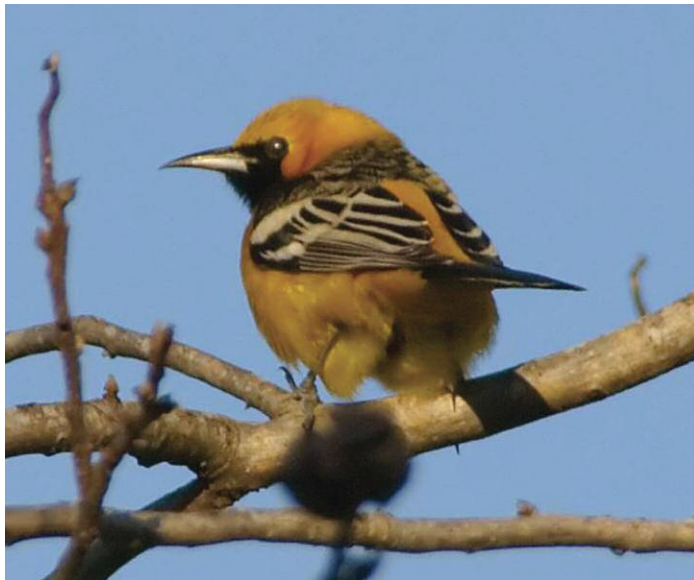
Hooded Oriole. Baldwin County, Alabama; 29 January 2009.

mature Snowy Owl continued in Spring Hill, Maury , TN. An adult male Broad-billed Hummingbird, AL's 5th, was discovered on 1/23 in Baldwin . Single Lark and Lincoln's Sparrows were attending feeders in Berkeley , WV 1/27+. A Harris's Sparrow continued at Paynes Prairie SP, Alachua , FL.