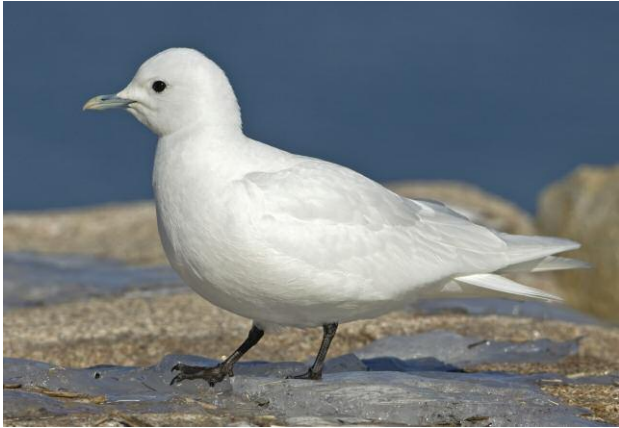
Ivory Gull. Plymouth, Massachusetts; 30 January 2009.

ing for a remarkable 7–8 individuals in the state thus far this winter. The Black-headed Grosbeak continued in Knox , ME. A male Eurasian Siskin reported 1/31 in Sagadahoc , ME was a 1-day wonder.