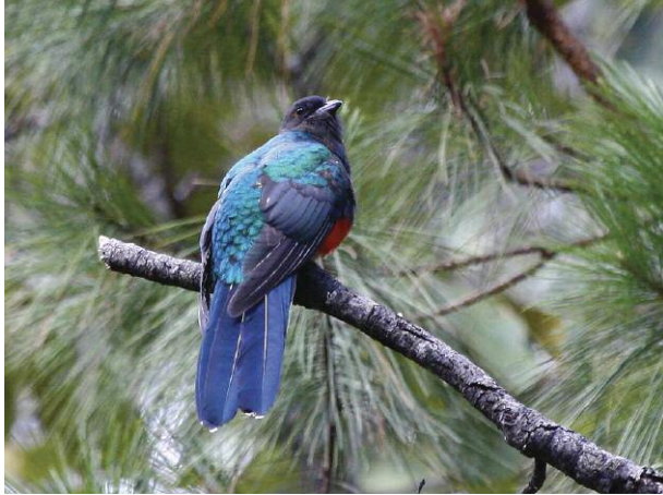
Eared Quetzal. Barranca Rancho Liebre, Sinaloa; 26 January 2009.

Sinaloa 2/3–4. An Eared Quetzal was noted near San Sebastian del Oeste, Jalisco in mid-Jan. Quetzals seem to be getting easier to find in Sinaloa, as well, with increasing reports now coming from Barranca Rancho