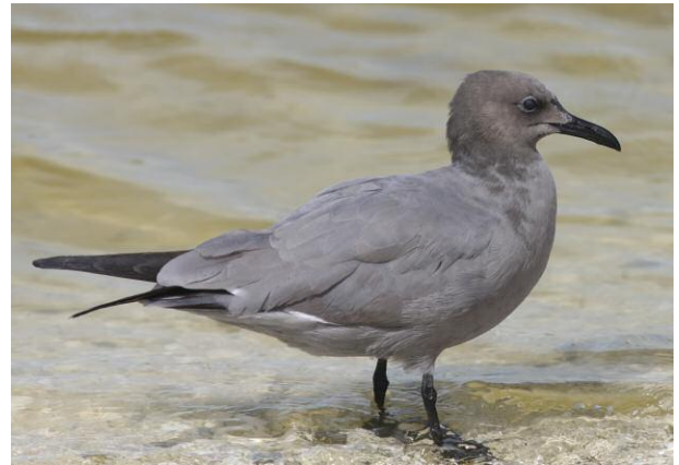
Gray Gull. Celestún, Yucatán; 17 January 2009.

Mexico: An adult male Ruff, likely the same bird noted in 2007 and 2008, was at Lagunas de Chametla 1/12 and then at Marina Sur, Baja California Sur (BCS) on 1/13. North America’s 2nd Gray Gull continued in Celestún, Yucatán. A Solitary Eagle was reported from Barranca Rancho Liebre,