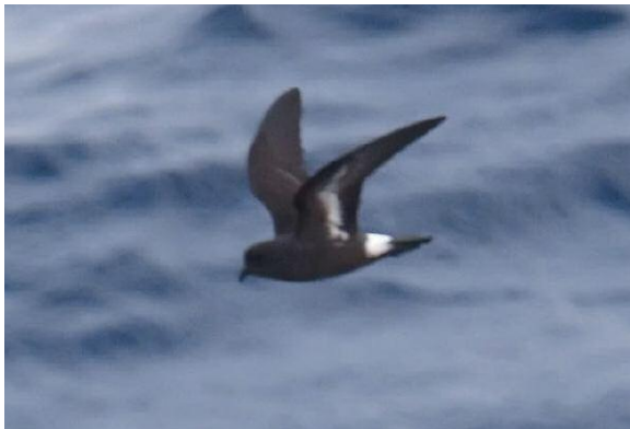
European Storm-Petrel. Off Hatteras, North Carolina; 29 May 2009.

were found at Digby Neck, NS in late May. A male Lark Bunting turned up in Kennebunk, ME 6/10. A Boat-tailed Grackle was reported from Freeport, NS 6/3–4. Common Chaffinches were noted in 3 different QC towns in late May; though probably escapees, the simultaneous appearance of the species in MI is interesting.