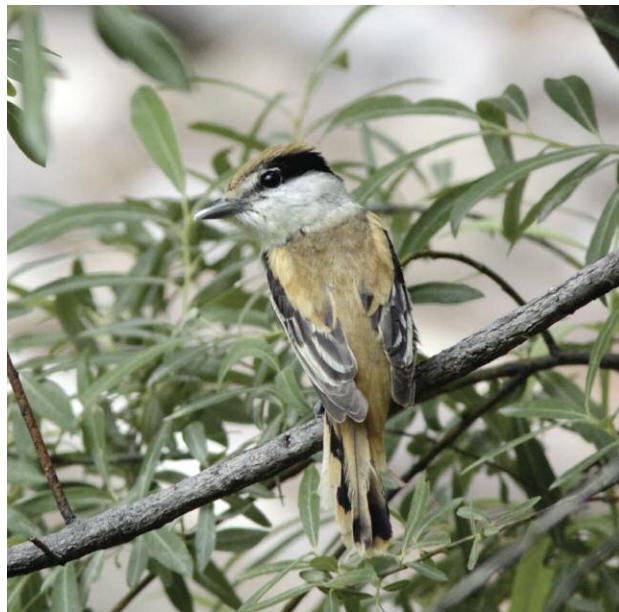
Gray-collared Becard. South Fork–Cave Creek, Arizona; 5 June 2009.

Jefferson, ID 5/24; a Magnolia Warbler was found at the same location 6/5. Two Hermit Warblers were in ID on 5/8: 1 in Elmore and the other in Owyhee . NV experienced a noteworthy incursion of Kentucky Warblers. A Fan-tailed Warbler was nicely photographed at the