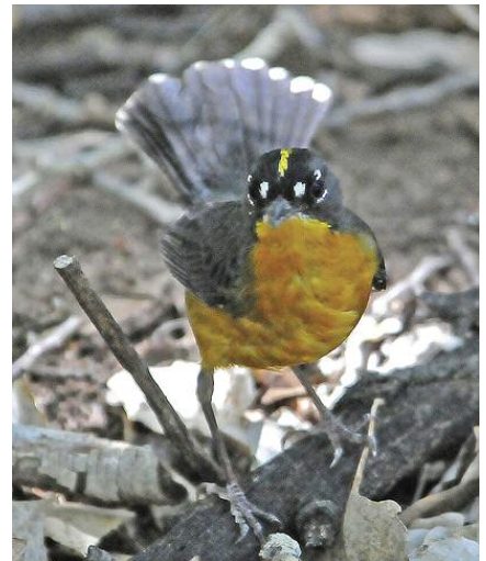
Fan-tailed Warbler. Roosevelt County, New Mexico; 19 May 2009.

Whitefish Point, MI, another in DuPage, IL, a Linnet at Tawas Point, MI, and multiple "Gray-headed" [Eurasian] Goldfinches in the Chicago area were