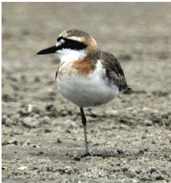
Greater Sand-Plover. Huguenot Memorial Park, Florida; 14 May 2009.

Northern Wheatear appeared at Temiskaming, ON 6/2. Lowden-Miller State Forest in Ogle, IL hosted a male Black-throated Gray Warbler 5/23–24. A Yellow-throated Warbler was found in Hiddenwood SP, Walworth, SD 5/16. A Worm-eating Warbler was in extreme western SD (Harding) 5/23–24, and a Green-tailed Towhee was found nearby a day earlier. A Chestnut-colored Longspur was found 5/30 at Thunder Cape Bird Observatory near Thunder Bay, ON, where a Lazuli Bunting turned up the next day. The presence of 8 Common Chaffinches at