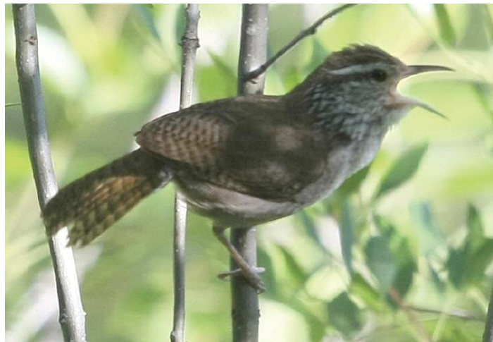
Sinaloa Wren. Patagonia, Arizona; 16 June 2009.

First discovered 5/29, NE's 1st Fish Crow was still being observed along the lower Platte R. in Cass, NE; MI's was still in Berrien. It was a great summer for Kirtland's Warbler in WI: 6 nests produced at least 23 young in Adams, where the 1st confirmed breeding in WI occurred only 2 years ago. A Lazuli Bunting was discovered paired up with an Indigo Bunting 7/18 in Sibley, MN. A new northernmost record for the species, a Henslow's Sparrow seemed to be on territory along the shores of James Bay at Paskwachi Pt., ON 7/27–29. An unprecedented IL record for July, a Lincoln's Sparrow was photographed in Sangamon 7/20. Montrose Point, Chicago, IL hosted a Lark Bunting 8/10.