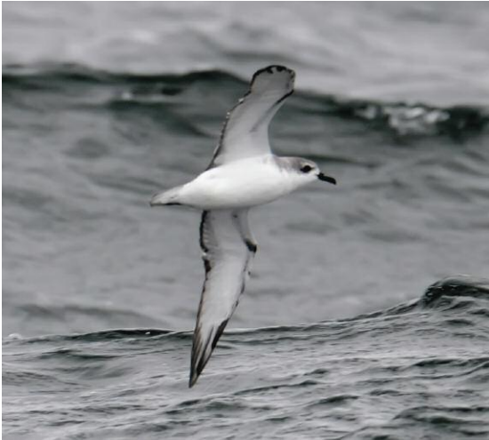
Cook's Petrel. 33.437907° N, 120.784910° W (Patton Escarpment northeast of San Juan Seamount), Santa Barbara County; 25 July 2009.

along the TX coast at Brazoria NWR 7/27. An imm. Brown Noddy was reported from Port Aransas, TX 7/9. An impressive 5 White-eared Hummingbirds were banded near Fort Davis, including a local juvenile, confirming the species as a new breeder in TX. The Cameron , LA Great Kiskadees were observed constructing a new nest 7/26. A Green-breasted Mango was seen 8/2 south of Austin in Hayes , TX.