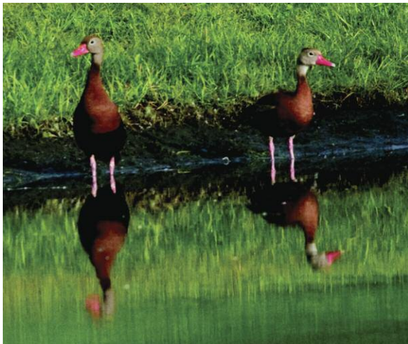
Black-bellied Whistling-Ducks. Lincoln County, South Dakota; 21 July 2009.

billed Cuckoos were found (dead) in Ferryland 7/11 and (alive) in Glovertown, NL 7/29. A Thick-billed Kingbird was reported from Grand Manan I. 8/8; if confirmed, it would be NB's 1st record. Two male Sedge Wrens set up territory near South Windsor, Hartford, CT. A Western Tanager was photographed 7/14 in Branford, New Haven, CT.