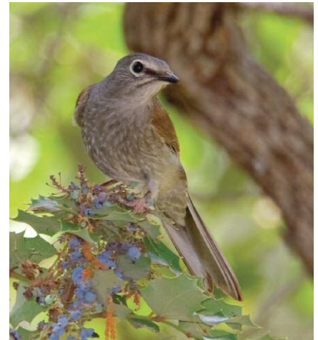
Brown-backed Solitaire. Ramsey Canyon, Arizona; 30 July 2009.

ridge Pt., ON 7/18. IL's 1st Green Violetear appeared briefly at a St. Clair residence 8/10. A Scissor-tailed Flycatcher was discovered 7/25 in Dodge, MN. KS's 6th record of Cave Swallow involved 3 individuals in Barton 7/29.