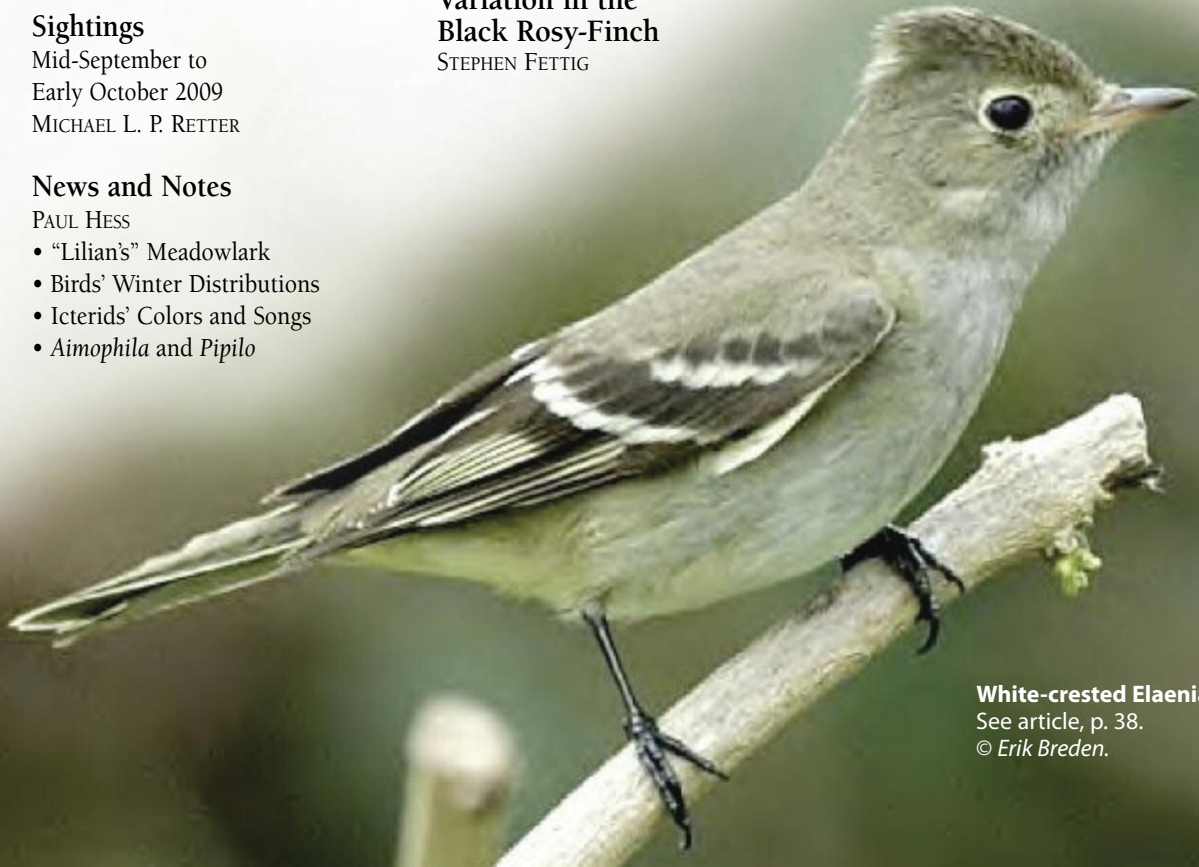
White-crested Elaenia. See article, p. 38.